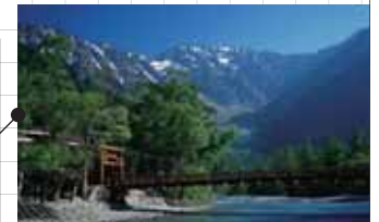
Special natural treasure-KAMIKOCHI