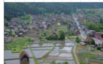
World Heritage site-SHIRAKAWA-GO