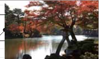
The Three Great Gardens of Japan-KENROKUEN