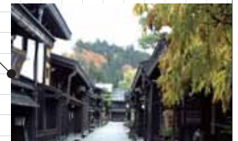
The Old streets-TAKAYAMA