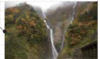
Special scenic spot-SHOMYO FALLS