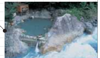
Hot spring resort-SHINHODAKA