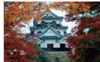
National treasure- HIKONE CASTLE