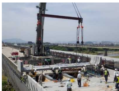
【Floor slab replacement】