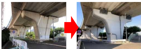
【Earthquake resistance reinforcement in the bridge】

*Limited to projects to expand existing expressways that contribute to reducing the risk of block of the road.(e.g. There is a risk of landslides or slope collapses during disasters)